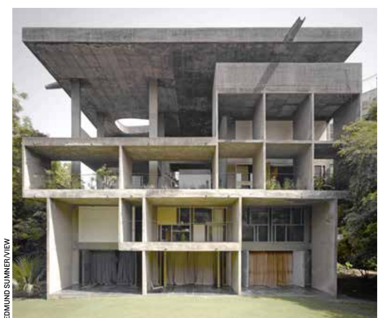
Top: Louis Kahn's Institute of Management in Ahmedabad is at risk of demolition Bottom: Le Corbusier's Shodhan House in the same city may also be at risk

Museum, Doshi's CEPT School of Architecture and his studio Sangath. Hopefully the Gandhi Museum is inviolate but the CEPT campus is a prime site and in the current political atmosphere of Gujarat may well be vulnerable. The Chief Minister of the State of Gujarat, Narendra Modi, who is running for Prime Minister of India in the coming General Election, represents the BJP, a political constellation which combines aggressive business practices with elements of Hindu fundamentalism and which has not been above inter-community frictions (Modi has not been able to shake off the perception that he may have turned a blind eye to murderous rioting in Ahmedabad in 2002). All of this is miles away from the balanced secularism that supported Modernism in the early