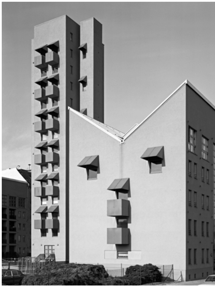
John Hejduk's recently preserved contribution to the 'Postmodern' Berlin IBA, 1986-7

Berlin as a progressive entity on the world stage in contrast to its eastern counterpart, and to perpetuate its image as the centre of German culture by updating its architectural profile.